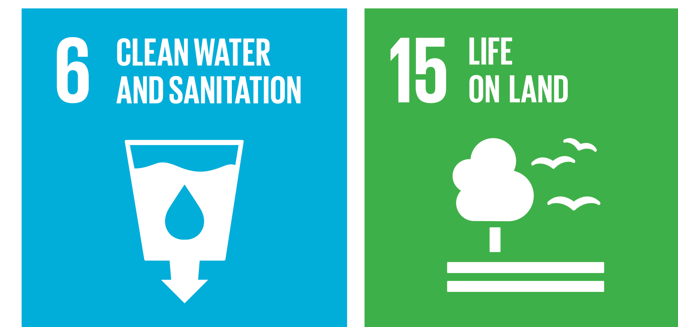
Sustainable Development Goals 6 and 15